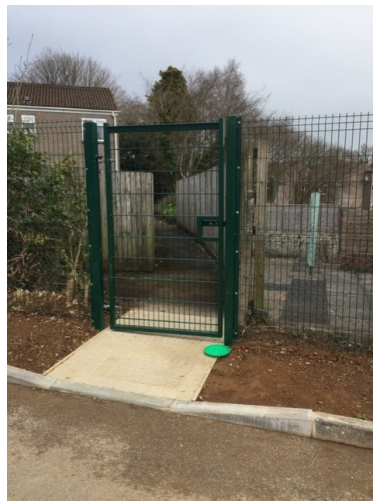
A new Year six entrance at the back of the school.