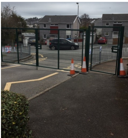
Higher gates at the front.

Here a few photos so you can get an idea of the full extent of the work carried out.