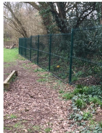
Discrete, sturdy fencing that fully encloses all boundaries, ensuring there are no breaks in the security.