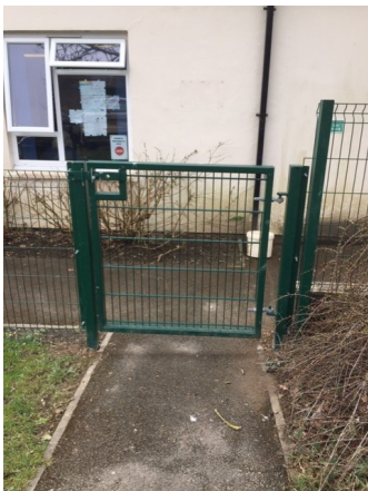
Fences and gates on internal paths for added security.