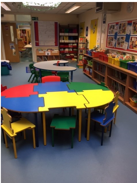
Infant Work Area

We thought, as we cannot have visitors at the moment, that you may appreciate having a look at what the Infant Department rooms look like following the flood damage re-fit. It was enormously hard work getting ready for September, but hopefully you will agree all the effort was worth while!