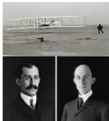
The Wright brothers

Bessie Coleman was the first woman of African-American descent to hold a pilot license. She got her license in 1921.